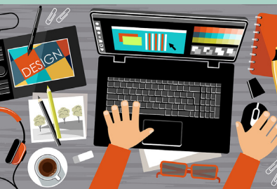
Creative Digital and Graphic Designers are in-demand.