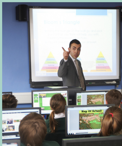
Teachers are one of Britain's most in-demand jobs