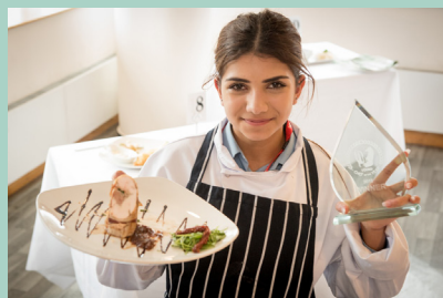
Young Chef of the Year 2015