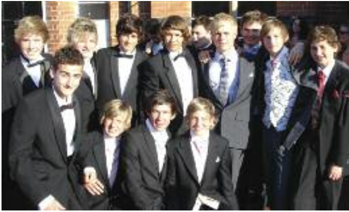
Dressing up for the year 11 Prom.