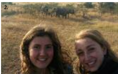
1. Resting at the top of Mount Kenya.