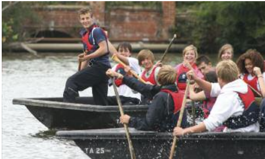
Sixth Form Induction Day.