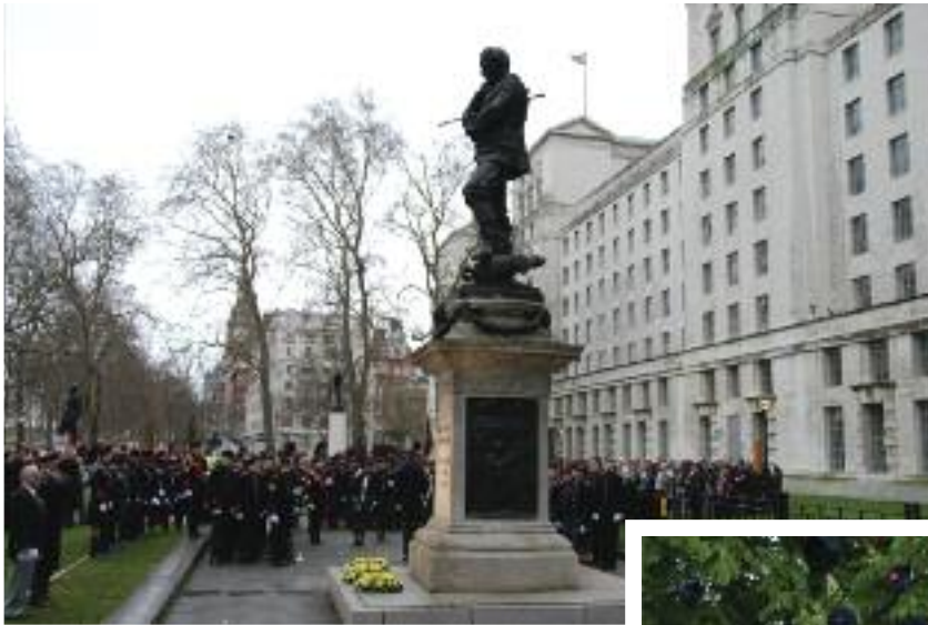
Service at the General Gordon Statue.