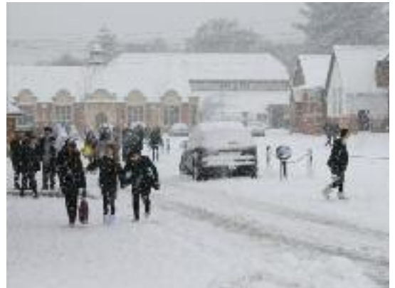
A snowy day at Gordon's.