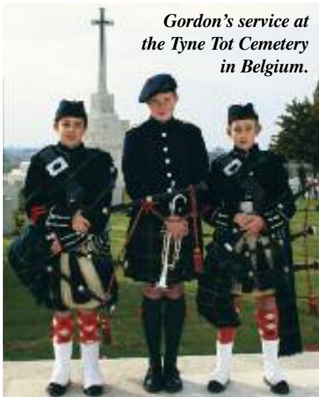
Gordon's service at the Tyne Tot Cemetery in Belgium.