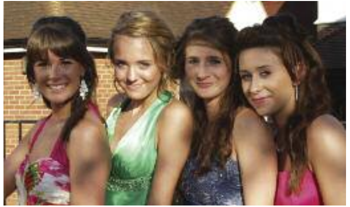
Dressing up for the year 11 Prom.