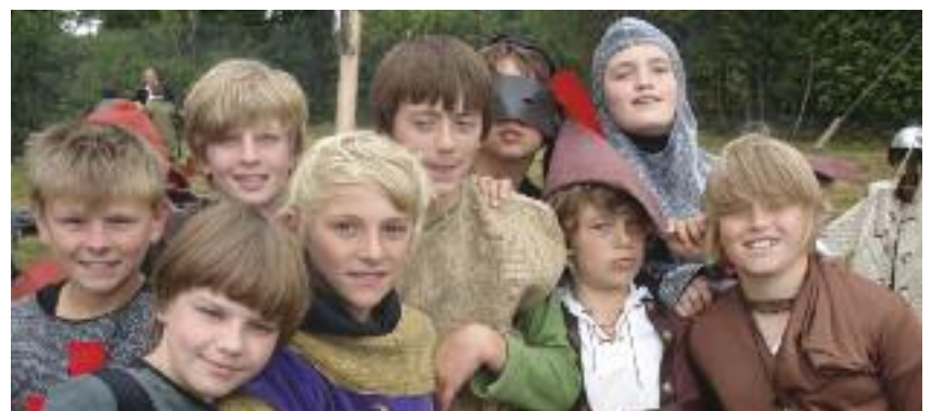
Year 7 Camp – Dressed up!