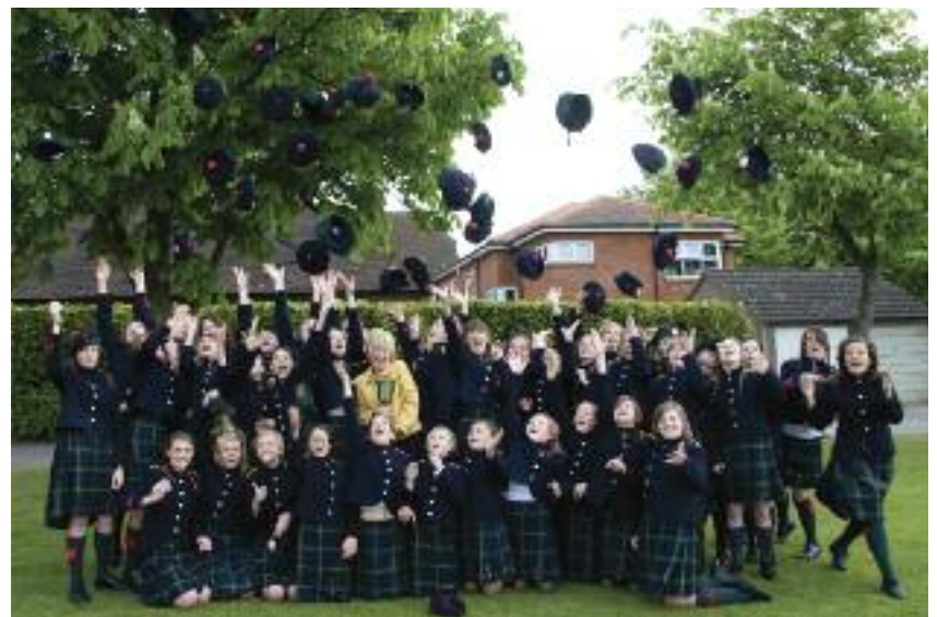
China House Girls celebrating winning the Longmoor Cup.