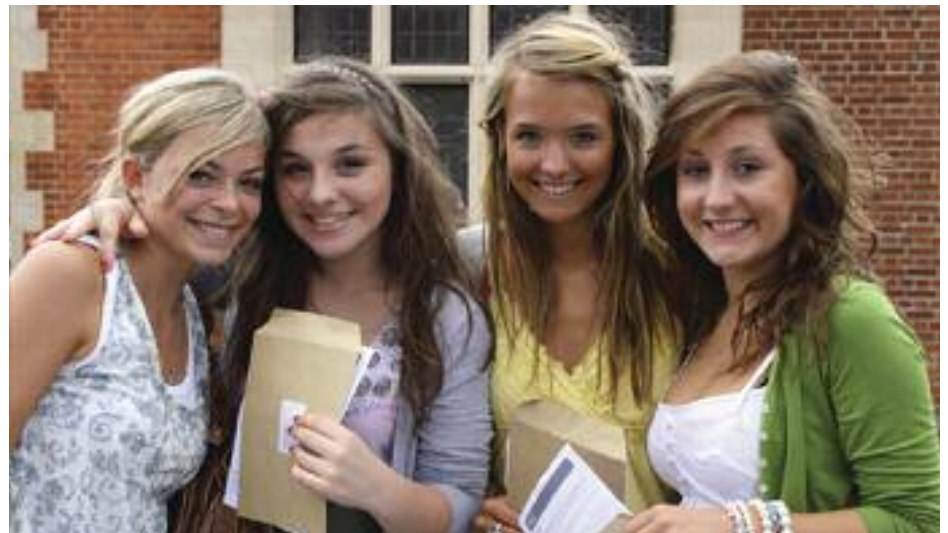
GCSE Results Day.