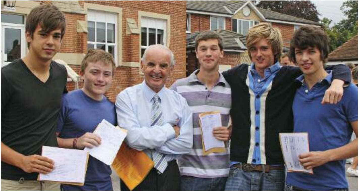
Fantastic results on A-level Day.